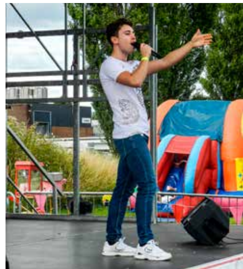
MC, Drag Queen, 'Lavender Love', who is in the final three of the MX Drag England competition and could be crowned the best Drag Queen in England on 20th August.