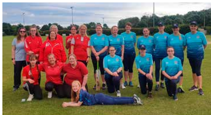
Photo: The victorious Aycliffe's ladies team (in blue) and their counterparts from Sacriston (in red).

The Aycliffe senior ladies team got their league season off to a great start with a comprehensive victory by 81 runs at home to Sacriston in the Durham Womens League.