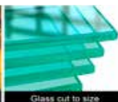
Glass cut to size