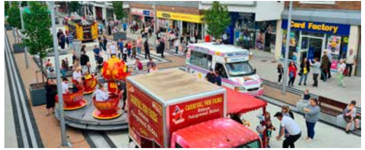
Emergency Services Day

Saturday 31st July was the turn of the local sports teams to come along and have the opportunity to recruit new members. There were also fabulous displays by the children from Infinity Dance, McAdam Dance School, Zanshin Karate and Athena Sports Academy. Luckily the weather held out for us and, apart from a few drops of rain on the final day, the events enjoyed good weather. Here are a few images from the events including MP Paul Howell.