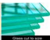
Glass cut to size