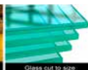
Glass cut to size