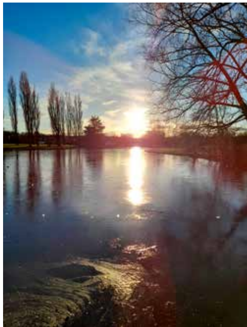
Darran Weston took this picture of West Park Lake on a gorgeous sunset evening. Thought I'd share them with your readers as the ice reflecting the sun looks stunning.