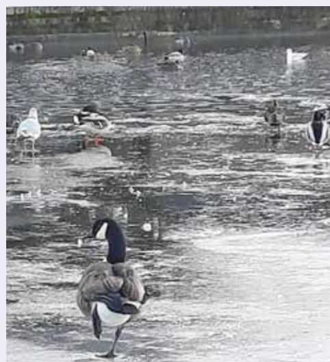
Views around the Boating Lake by Yvonne Wood (Newton Aycliffe FC Treasurer).