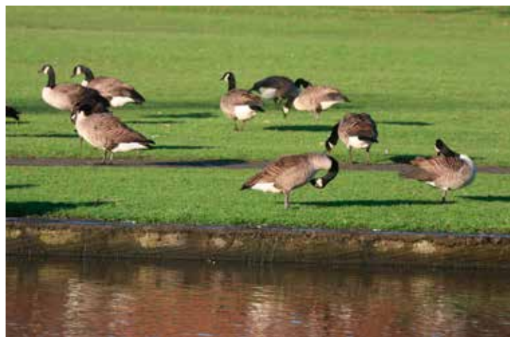
Some of the Canada geese at West Park