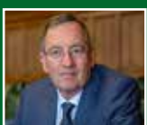
Paul Howell Member of Parliament for Sedgefield

For more information or to report a case of fraud, visit www.durham.gov.uk/fraud - To find out more on ways to spot a scam, visit www.friendsagainstscams.org.uk