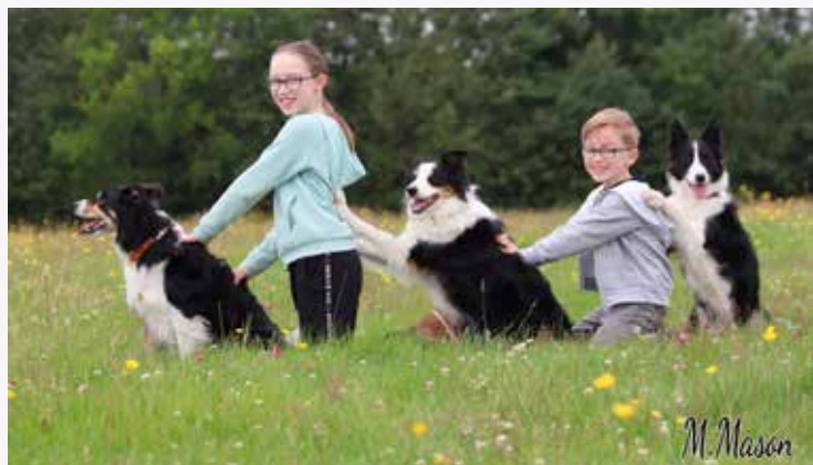
My dogs and grandkids doing the conga on the fields behind Woodham Academy