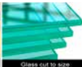
Glass cut to size