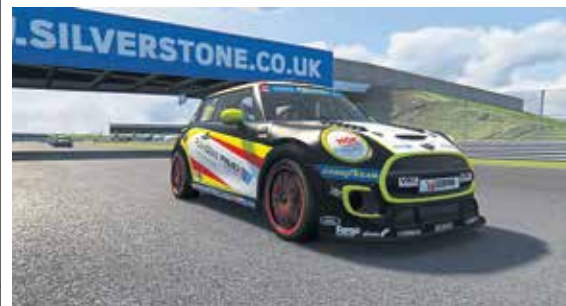
Photo: Max Coates in action at the MINI CHALLENGE UK Official eSeries at Brands Hatch