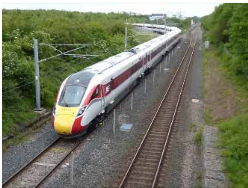
Here is a photo of a "NEW" L.N.E.R. Azuna 801 218, leaving Hitachi Factory, Send your photos to paul@newtonnews.co.uk