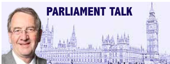
Paul Howell, Member of Parliament for Sedgefield