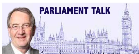
Paul Howell, Member of Parliament for Sedgefield

For further information about Lucid Technology Solutions contact Tel: 01642 792 567 (Stockton office), 0191 792 567 (Team Valley office) or 01325 792 567, hi@lucidgrp.co.uk or visit the website www.lucidgrp.co.uk