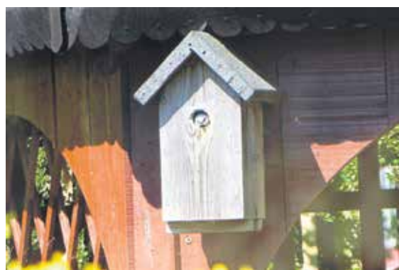
It looks like we're all self-isolating. Send your photos to paul@newtonnews.co.uk