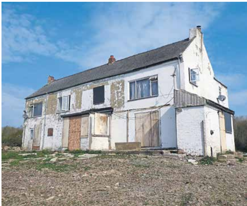
This is a photo of Hill House Farm house at the new Forrest Park Industrial Estate, before it is demolished. Send your photos to paul@newtonnews.co.uk