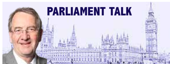
Paul Howell, Member of Parliament for Sedgefield

The impact of the Coronavirus is hitting people in many ways and the range of emails and calls we are getting is immense. The biggest priority for us all is to take notice on the recent advice on Social Distancing and I would implore you all to take notice and follow advice, it is for ALL our benefits.