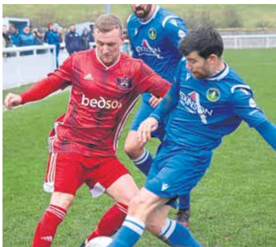
Penrith 1-4 Newton Aycliffe

In the 35th minute the game turned on its head as Aycliffe extended their lead from the penalty spot after Penrith felt they should have had a penalty of their own seconds early following a coming together between