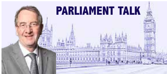
Paul Howell, Member of Parliament for Sedgefield