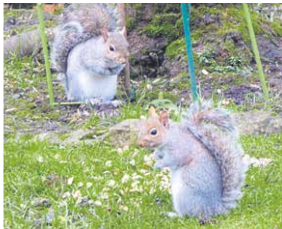
Family "Gathering nuts in May" (January!)