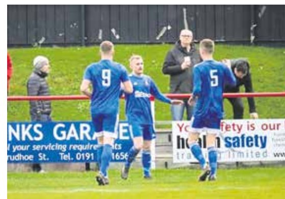
Saturday 7th December Ebac Northern League Division One North Shields 3 v Newton Aycliffe 2