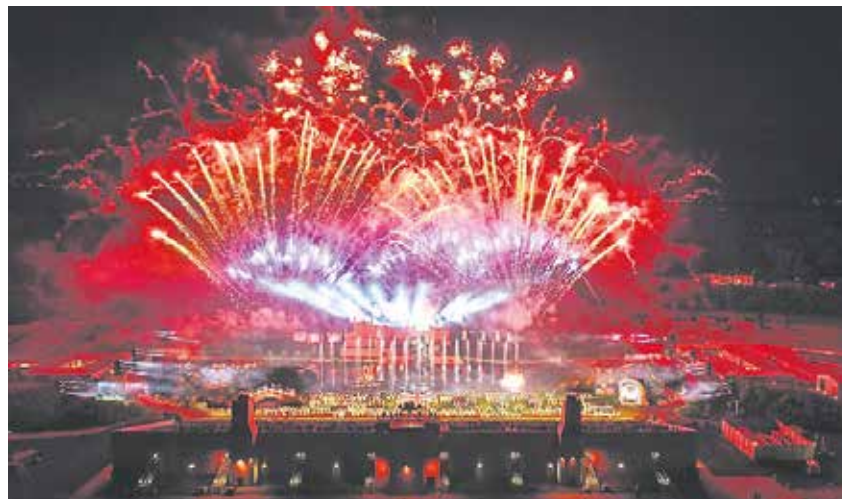
Last Year's Fireworks Display at Kynren, Bishop Auckland

Don't miss the North East's Biggest Pyromusical Fireworks Spectacular on Saturday November 2nd. Lighting up the night skies above Bishop Auckland this amazing event provides the perfect fireworks night out for families which can be enjoyed from the comfort of your very own seat. Brought to you by Eleven