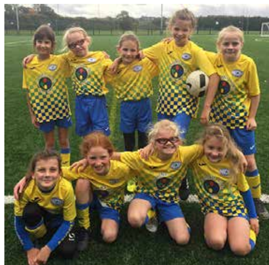
NAYFC U9 Angels

as well as we could whilst enabling the Angels to express themselves.