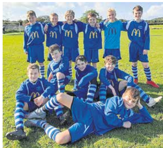
NAYFC U9 Eagles