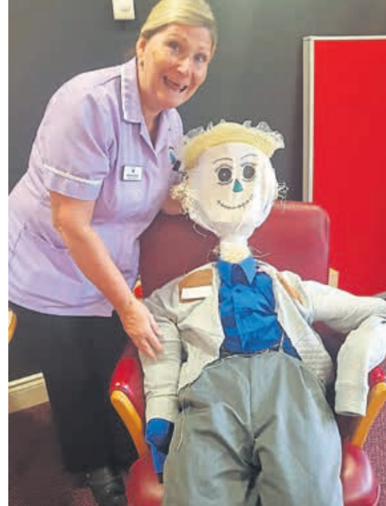
Lindisfarne Care Home