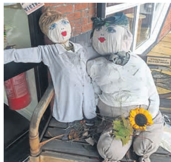
Defoe Court Care Home