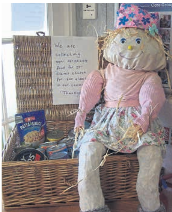
"Rose" our little Rose Lodge scarecrow