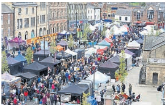
The full line up of celebrity chefs will be announced in early 2020. To stay up to date with the latest festival news, visit www.bishopaucklandfoodfestival.co.uk or follow @bishfoodfest on Facebook, Twitter and Instagram.

A food festival that attracted more than 29,000 people in April will serve up even more tasty treats, celebrity chefs and culinary inspiration when it returns next year. Organiser Durham County Council has confirmed the 15th annual Bishop Auckland Food Festival will take place on Saturday 18 and Sunday 19 April 2020. Traders can now apply for stands at the festival, which prides itself on showcasing the finest produce the region has to offer, along with exciting street food inspired by international cuisines. Last year, the event attracted more than 29,000 people to the historic market town, boosting the takings of local businesses and more than 150 traders. Hundreds of people enjoyed demonstrations by celebrity chefs including BBC MasterChef co-presenter Gregg Wallace who described Bishop Auckland as "one of the nicest, friendliest places I've been." Feedback was extremely positive, with more than 90 per cent of the visitors surveyed rating the festival as good or very good. Ninety-six per cent of the local businesses surveyed also agreed the event was good for Bishop Auckland. Next year's offer looks set to be just as appetising, with