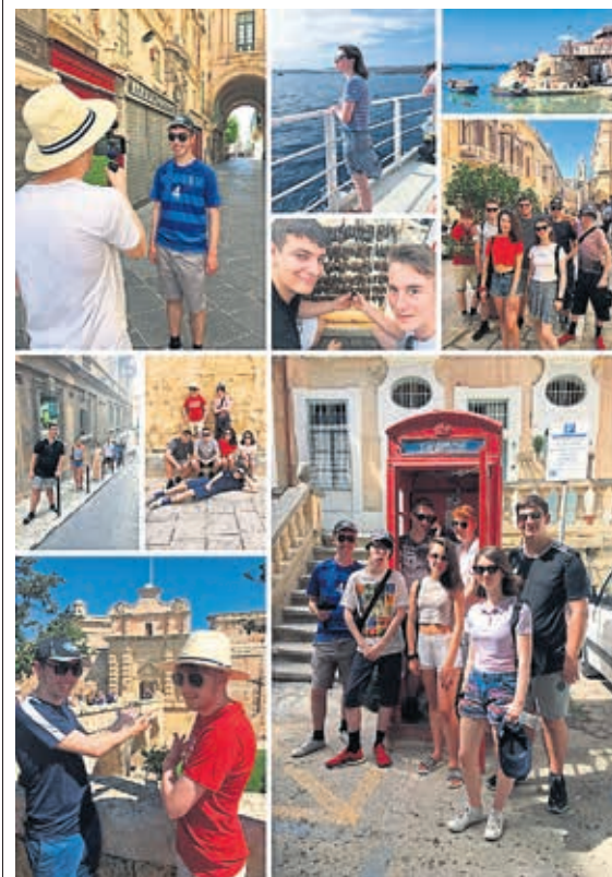
Photo: Students gathered film footage at multiple locations across the island.

appears frequently in Game of Thrones; and the capital city of Valletta, which offered multiple locations connected to WWII history. This international trip gave students the opportunity to gain experience in script writing, TV presenting and filming, alongside the complex planning issues that are faced by producers when creating a product. Once finished, all travel documentaries will be uploaded to the Academy website and YouTube for viewing by the general public.