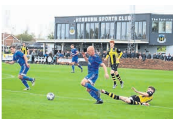
Saturday 5th October Ebac Northern League Division One Hebburn Town 2 v Newton Aycliffe 1