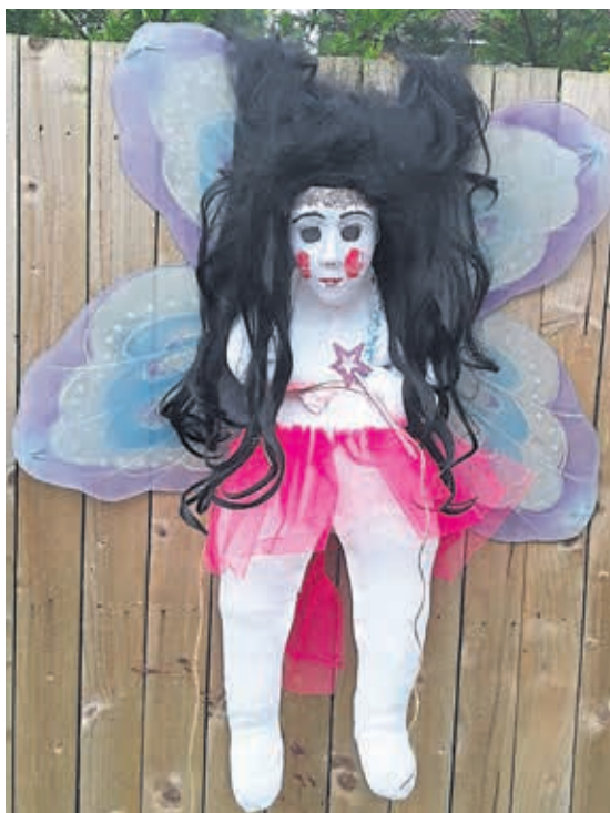
St. Clare's scarecrow named "Scary Mary the Fairy"