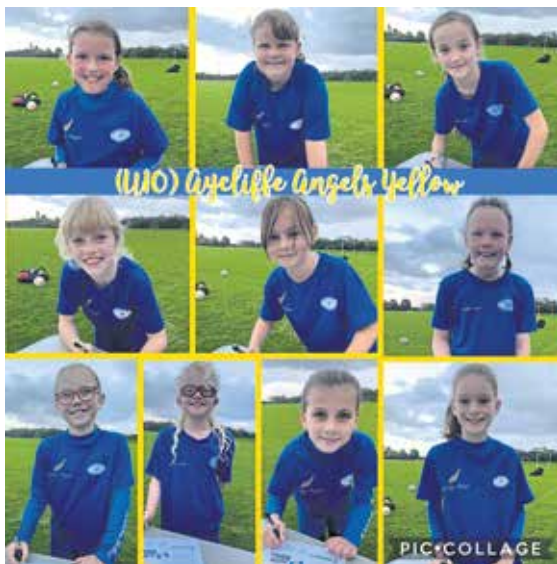
As well as the U10 Angels Blue. We only do positive!