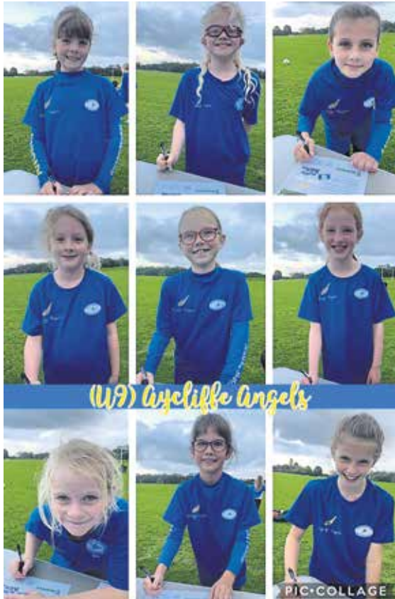
Aycliffe Angels U9 and U10 Angels Yellow all signed contracts with NAYFC last week.