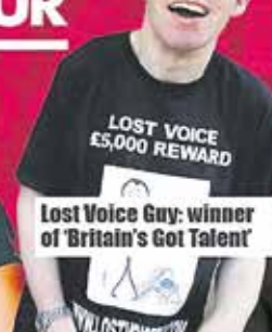
Lost Voice Guy: winner of Britain's Got Talent