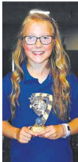
Mini Soccer Goalkeeper of the Year (U6-U12 Girls & Boys)