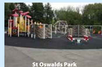
St Oswalds Park