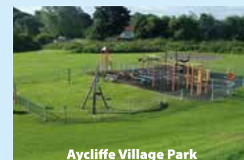
Aycliffe Village Park

FOR FURTHER INFORMATION TELEPHONE 01325 300600