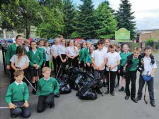
Sugar Hill Primary School