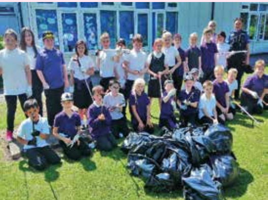
Stephenson Way Primary School

Each school that has taken part has received an interactive presentation about the consequences of litter before being given the opportunity to do a litter pick in the local community.