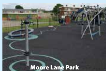
Moore Lane Park

Recommended for ages 3 to 8 years, * except Adventure Park for 8 to 14 yrs. Height and age restrictions apply to inflatables and fairground rides. See website for full details www.great-aycliffe.gov.uk/oakleafsportscomplex