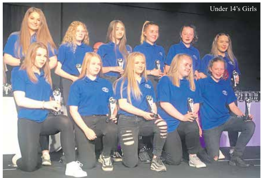
Under 14's Girls