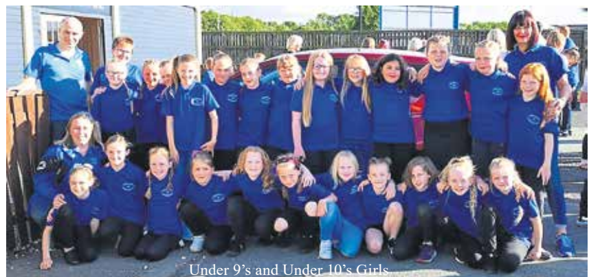
Under 9's and Under 10's Girls