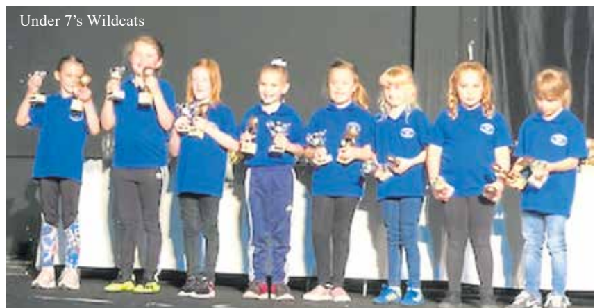
Under 7's Wildcats

Newton Aycliffe Youth FC, Girls, travelled in numbers to the Russel Foster League Presentation Night, to collect their well deserved awards for the season. Under 14's picked up the First Division championship having won all 21 league games, scoring over 100 goals. This was a huge achievement for this group of girls. This was followed by the Under 10's Wildcats taking their First Division championship, in the final