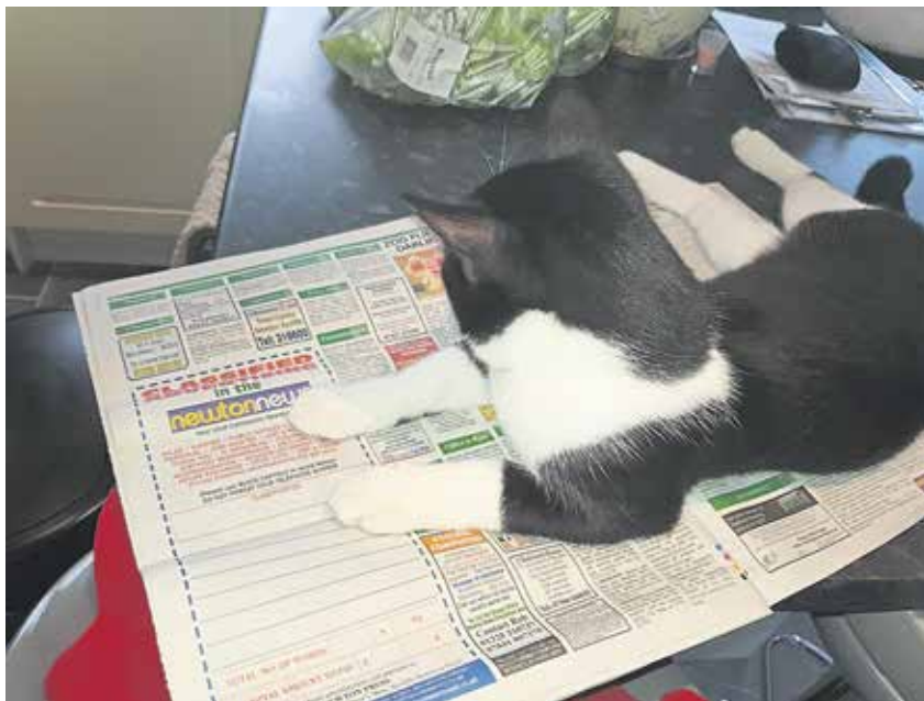
"Even BB the cat enjoys the Newton News!!"