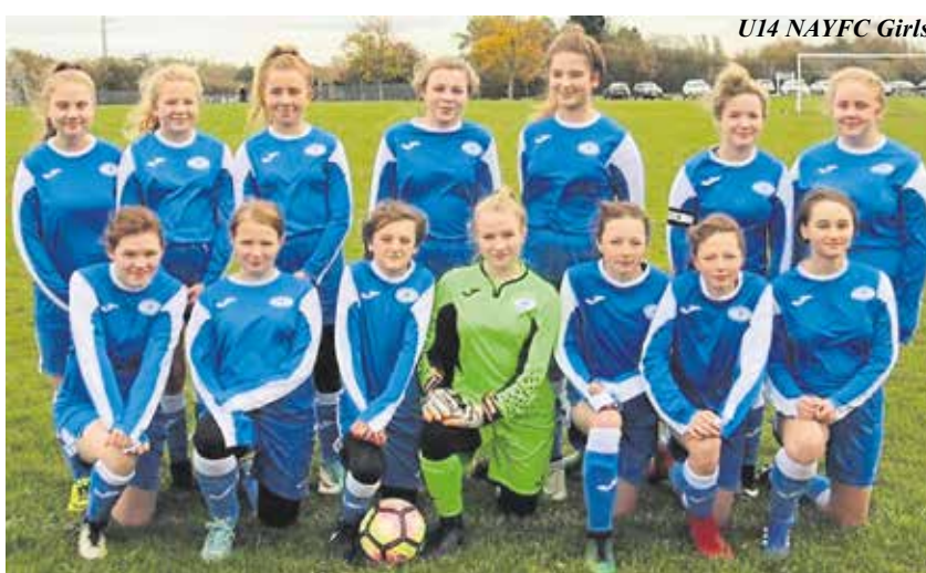
U14 NAYFC Girls