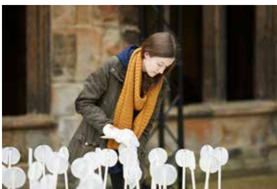
Community participants installing Entre les rangs for Lumiere Durham 2017