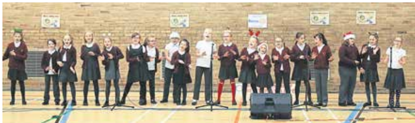
Vane Road School