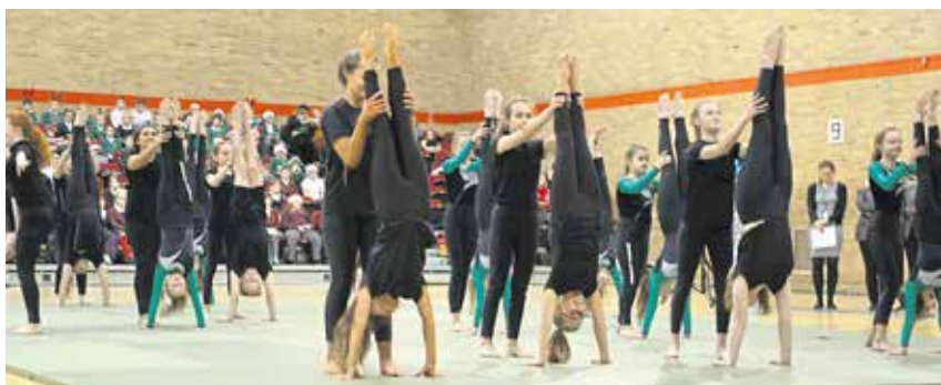
Woodham Academy Gymnasts