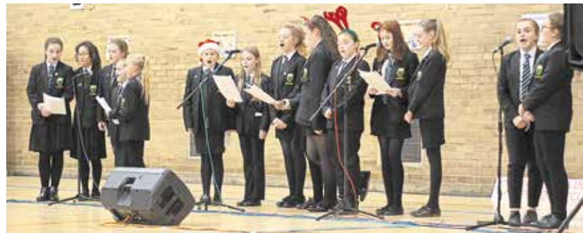
Greenfield Community Arts College