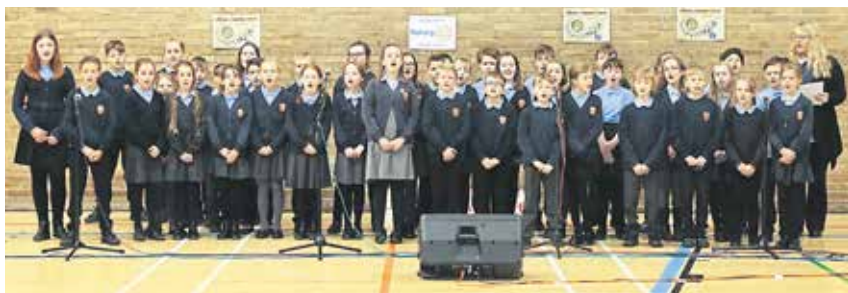
Aycliffe Village School