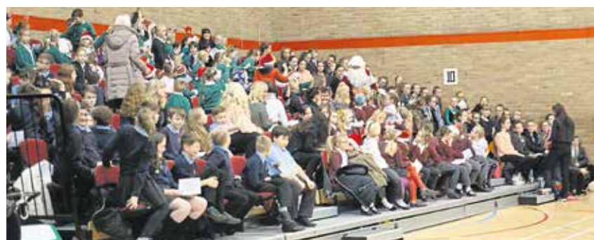
Santa's visit was welcomed by the children