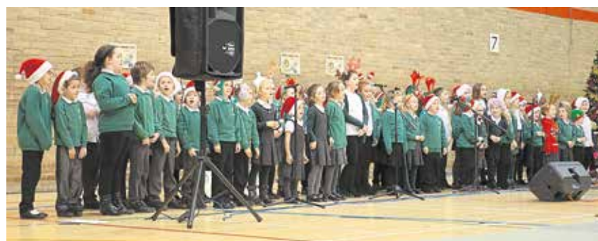
Sugar Hill Primary School