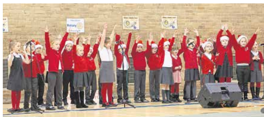
Woodham Burn Primary School