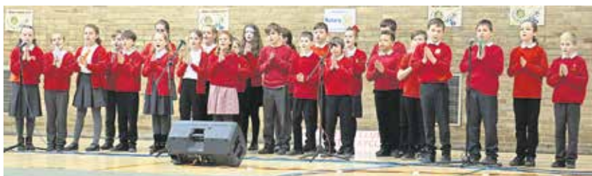
St. Joseph's RCVA School