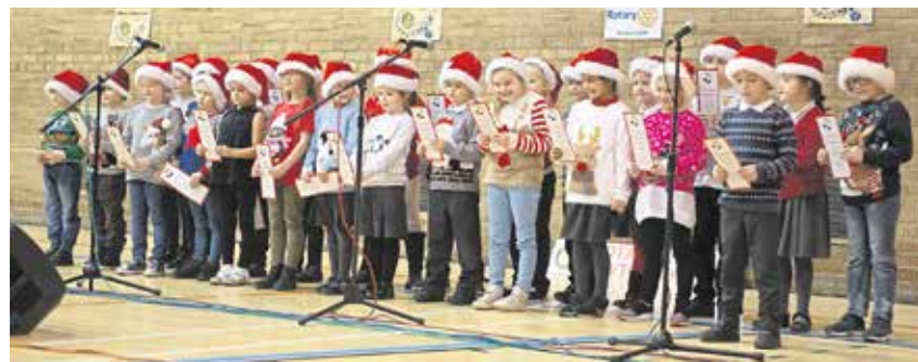
Horndale Primary School

The Rotary Club look forward to seeing you again next year to celebrate Christmas with the youth of the town.