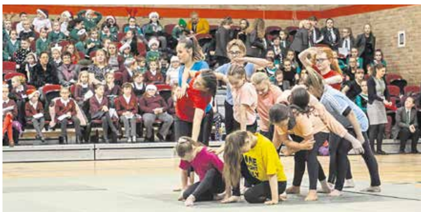
Woodham Academy Dancers