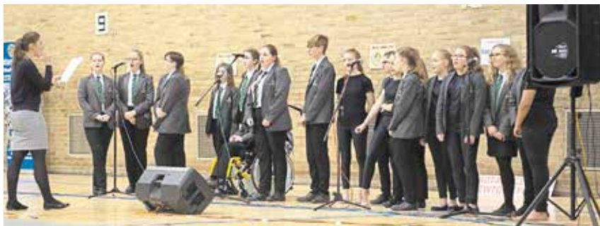
Woodham Academy Singers