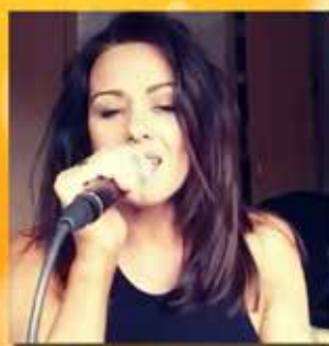
Cassandras tribute to DUA LIPA