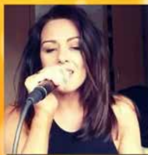
Cassandras tribute to DUA LIPA