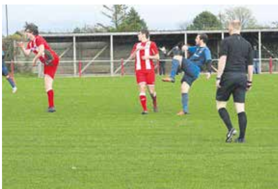
Saturday 3rd November 2018 Ebac Northern League Division One Ryhope Colliery Welfare 1 v Newton Aycliffe 1

Newton Aycliffe came away from Ryhope Colliery Welfare with a 1-1 draw, but they should really have taken all three points. They squandered several good chances, and conceded a late goal. Both sides played some good football in the extremely windy conditions.