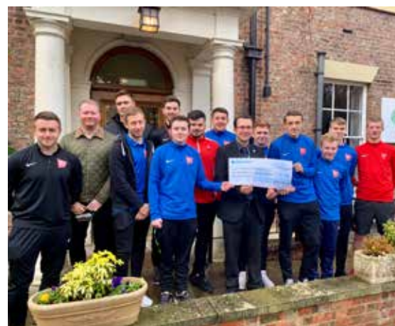
HND Sport students and tutors presenting cheque to St Teresa's Hospice