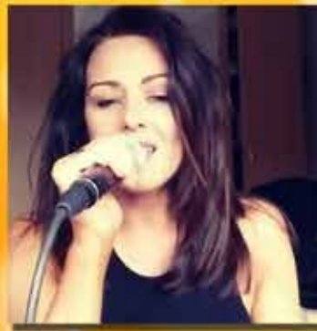
Cassandras tribute to DUA LIPA