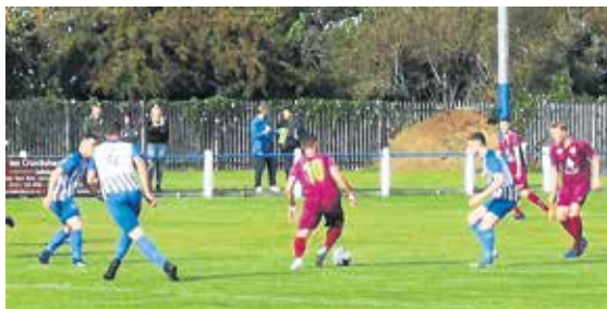
Saturday 6th October Ebac Northern League Division One Newcastle Benfield 3 v Newton Aycliffe 0