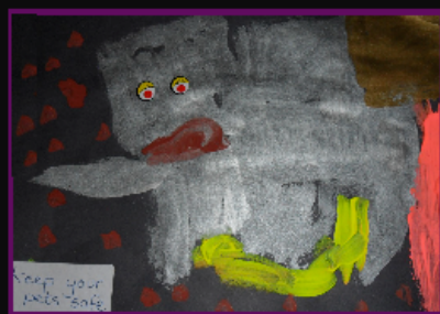
Last years winner in the preschool/nursery category