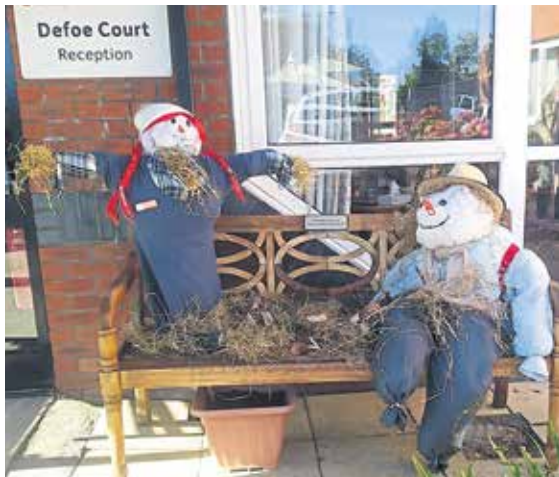
Defoe Court Care Home entry

Photos are of the scarecrows at Rose Lodge Care Home. The scarecrows were made by residents and staff at the home. The pink one is called 'Pinky' and the blue one is called 'Perky'. Along with the scarecrows we also hosted a Harvest Festival Food Bank which we donated to St Clares.