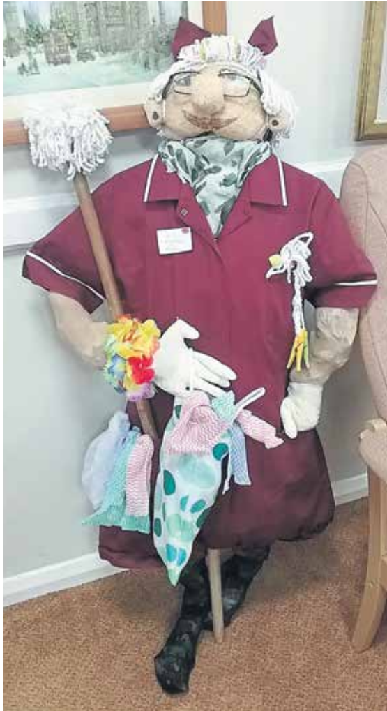
Scarecrow at Aycliffe Care Home Ada Mop