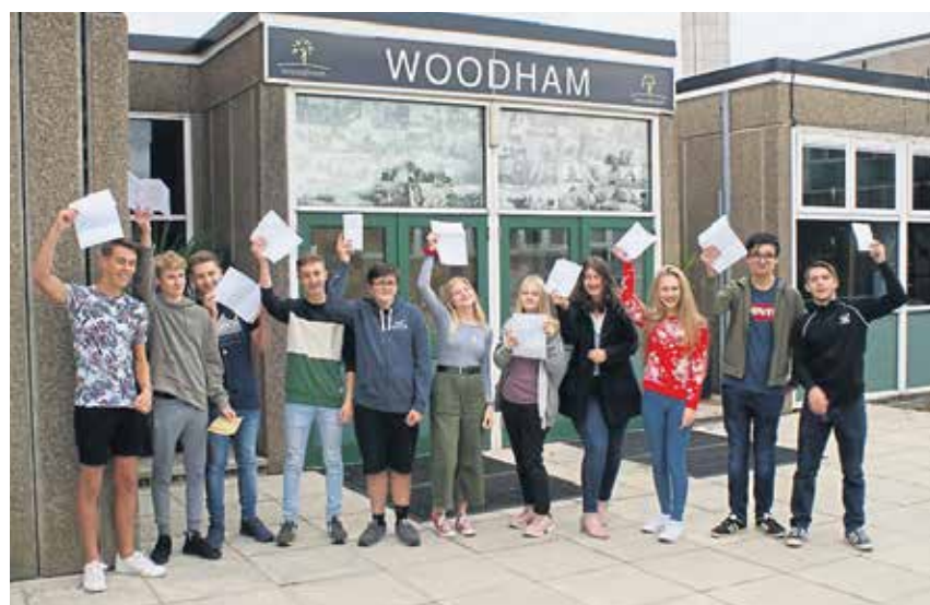
Woodham students celebrate another excellent set of results