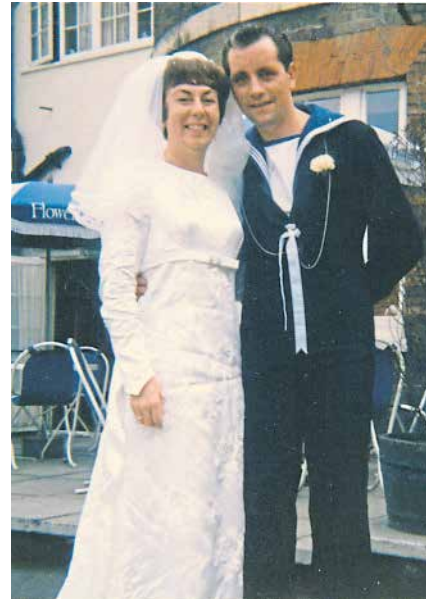
Golden Wedding Anniversary 10th August 2018 50 Golden Years Together