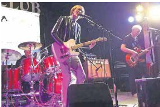
The Kent Collective

Great Aycliffe Festival 2018); and with the kind generosity of Aycliffe Town Centre Management. For more information about the event visit the website www.ayclifferadio.co.uk /festival