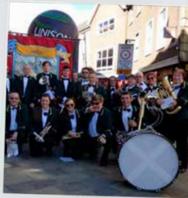
AYCLIFFE & BRANCEPETH BRASS BAND