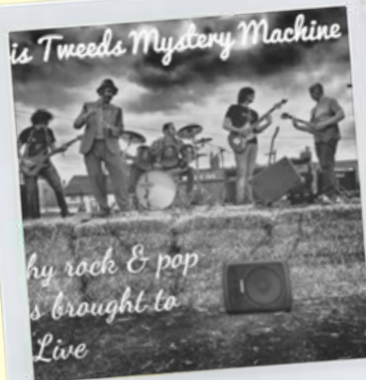
HARRIS TWEEDS MYSTERY MACHINE