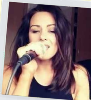
DUA LIPA TRIBUTE