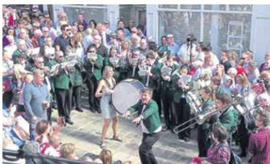
Aycliffe & Brancepeth Brass Band