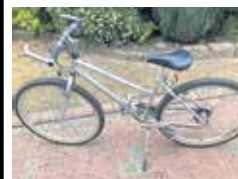
Ladies Raleigh Voyager good condition £100 tel 07572 614466