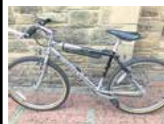
Men's Carerra Furnace 21 gears good condition £120 tel 07572 614466

RENT a washing machine only £3.99 per week, no deposit, fully maintained. Bargain Buys, Shafto Way, 01325 321 678