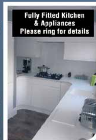
Fully Fitted Kitchen & Appliances Please ring for details

BATHROOMS WET ROOMS • EN-SUITES WE OFFER A FREE NO OBLIGATION DESIGN SERVICE