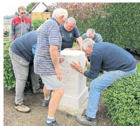
installation of two memorial riverbanks and the other in benches – one on the Durham Thiepval.

The cost of the stone, which was made in Durham before being shipped over to France, was paid for using the remaining funds from the 2016 Northern Echo public appeal, which culminated in the