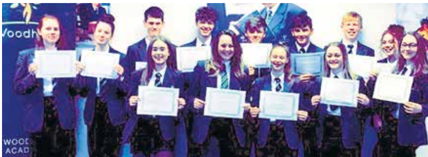
Woodham Academy students selected for the Thailand Experience.