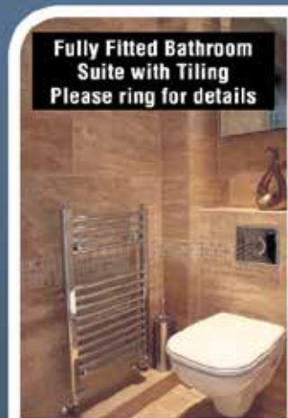
Fully Fitted Bathroom Suite with Tiling Please ring for details

Any like for like genuine written quote will be beaten