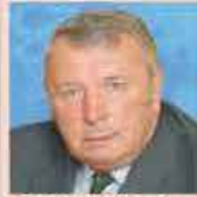
Robert S. Fleming Lab - Tel. 310025