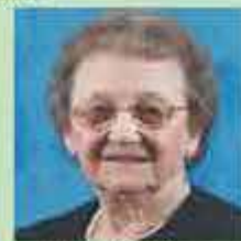
Mary Dalton Lab - Tel. 320499