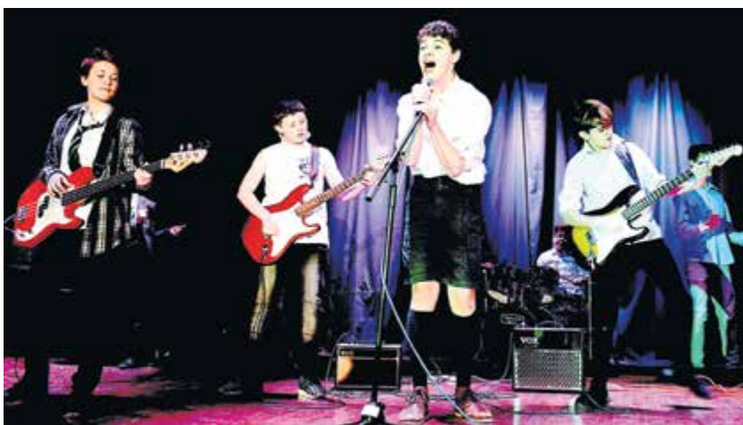
Students performing during the recent successful production of School of Rock

Pre 1948 our healthcare was dire With many poor families left in the mire Post '48 it was time for a change Free healthcare for all came into range With a rush on false teeth and spectacles too It was soon apparent the NHS worked for you We learned at the sound of siren to just clear the road Make way for the ambulance with a patient to offload No monies passed hands, your healthcare was free We've forgotten pre '48 there were no doctors for me Our buildings now old, our resources all on a squeeze Your donations are needed so do help us please With a state of the art MRI here just for you We need to invest but we'll need your help too It's our 70th Birthday so please give us a cheer Our blessed NHS – it's precious, please help keep us here! By Pat Chambers, Fundraiser for the MRI Appeal