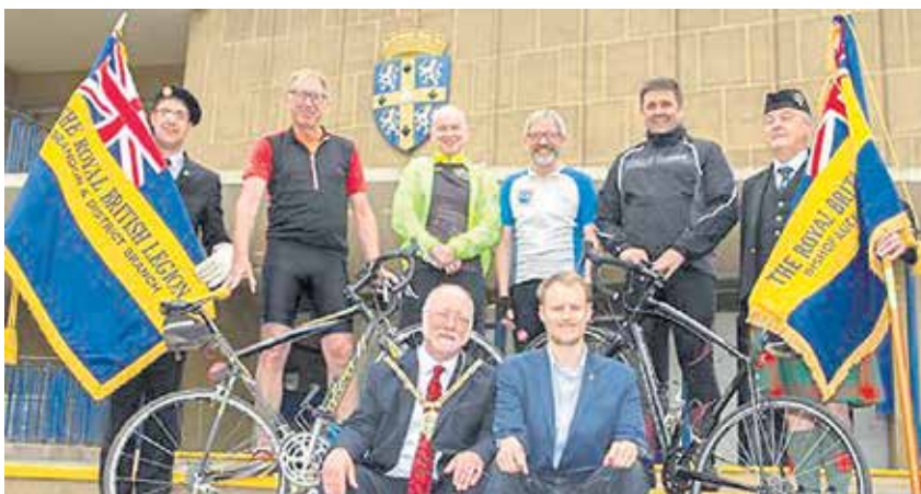
The team with Chairman of DCC and the Royal British Legion Flag Bearers