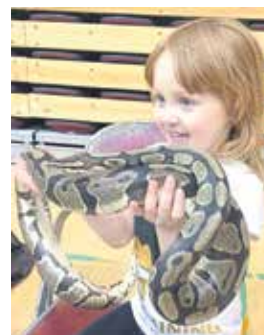
More photos on Page 3