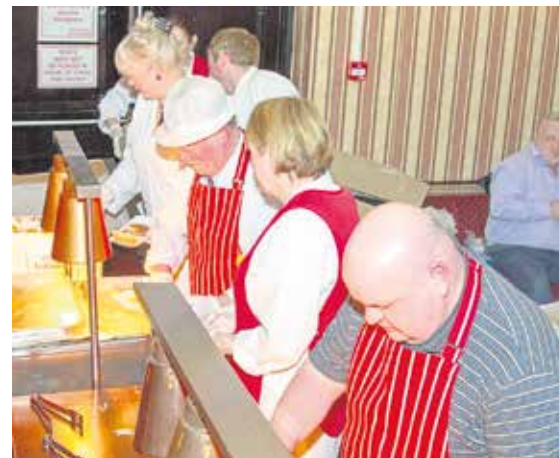
Walkers Caterers at work