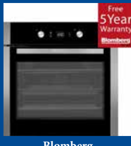
Blomberg Built In Single Fan Oven £319.99 inc 5 year guarantee