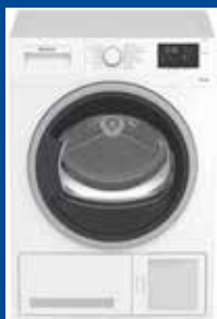
Blomberg 8kg Sensor Dry Condenser Dryer £319.99

Euronics Winter Sale - www.euronics.co.uk