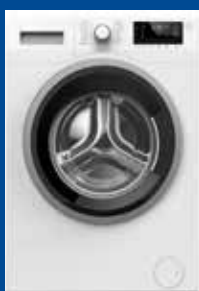
Blomberg 1400 spin 9kg Washing Machine 3 year guarantee £369.99