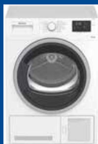
Blomberg 8kg Sensor Dry Condenser Dryer £319.99

Euronics Winter Sale - www.euronics.co.uk