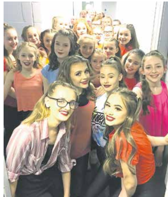
Woodham Dance Academy students at the Gala Theatre, Durham