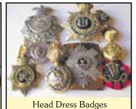
Head Dress Badges