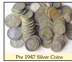
Pre 1947 Silver Coins