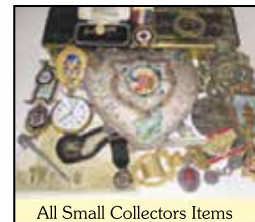
All Small Collectors Items

COXHOE VILLAGE HALL FRONT STREET EAST COXHOE DURHAM DH6-4DB