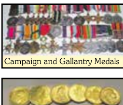
Campaign and Gallantry Medals