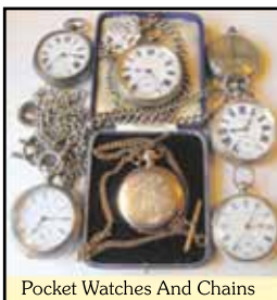
Pocket Watches And Chains