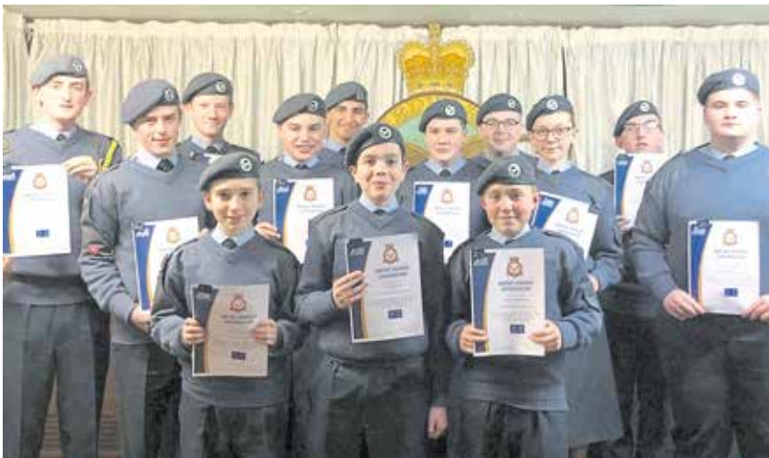
Cadets who gained Radio Operator certificates

1407 (Newton Aycliffe) Squadron Air Cadets recently held their annual presentation evening at the RAFA Club. The squadron continues to provide excellent opportunities for the cadets as was evident by the number of awards and certificates given out. The event began with the presentation of badges for academic achievements within the Corps and nationally recognised awards such as Heartstart First Aid certificates and BTEC Diplomas. These were followed by the presentation of Bronze, Silver and Gold Duke of Edinburgh's Awards.