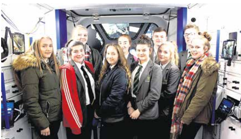
Woodham Academy students on board the 'Space Descent with Tim Peake' tour bus

Woodham Academy students took a trip to space and back – without leaving their school.