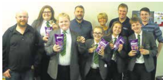
The winning team from Woodham Academy's Apprenticeships Challenge with representatives from Lucite.

Woodham Academy students joined forces with local employers to take part in the school's Apprenticeships Challenge.