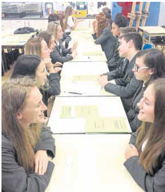
First session of the school's new Debating Society

The Debating Society will then expand to include students from years 7 to 9 and go on join national competitions.