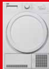
Beko 8kg Sensor Dry Condensor Easy Iron Function Free removal of old appliance when you mention this advert