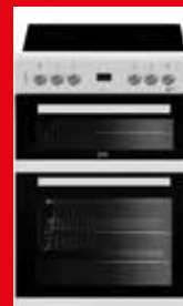
Beko 60cm Ceramic Double Oven Cooker (also available in black) Free install when you mention this advert

NEW - Many more clearance items in stock - NEW Washing Machines from £179.99 with 2 year guarantee Fridges from £109.99 with 2 years guarantee Freezers from £119.99 with 2 years guarantee Cookers from with 2 years guarantee Fridge/Freezers from £169.99 with 2 years guarantee