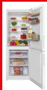
CCFH1675W 175cm tall, 60cm wide 60cm deep

BARGAIN BUYS Shafto Way, Newton Aycliffe DL5 5QN Telephone: 01325 321678