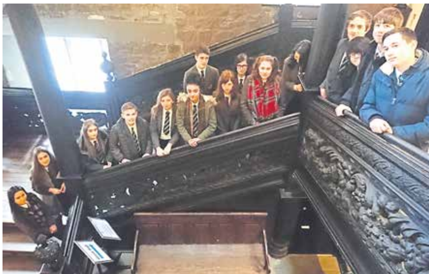
Students on The Black Staircase in Durham Castle.

Year 10 History students visited the city's Castle and Palace Green Library on the trip organised through Durham University's 4schools programme. The 15 students were taken on a guided tour of the 11th century Durham Castle, and learnt about how the county was once ruled by Prince Bishops.