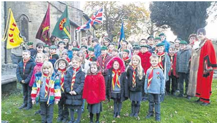
Aycliffe Village children at Remembrance Day Service

The townspeople lined the route at Newton Aycliffe for the Remembrance Day Parade along Central Avenue and St Cuthbert's Way to St. Clare's Church on Sunday. Even with the large crowd watching the parade, a respectful silence was observed perfectly.