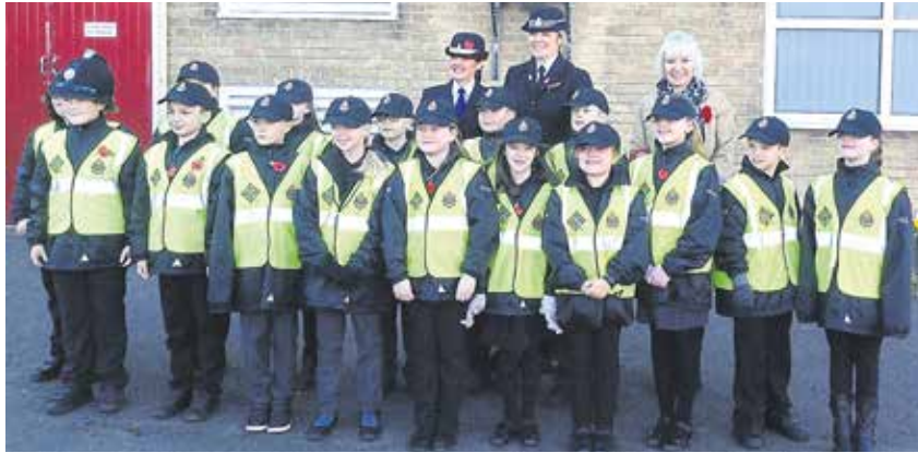
Sugar Hill School Mini Police were on parade.