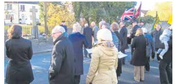
Residents pay homage at the War Memorial, Middridge