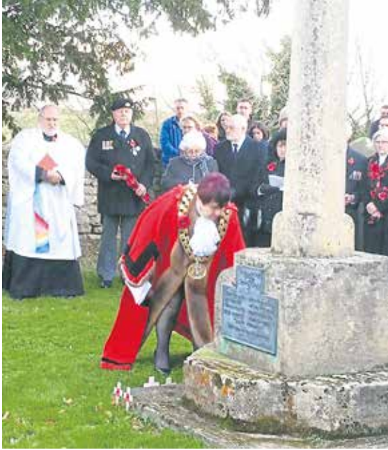
Mayor lays a wreath at Aycliffe Village Memorial