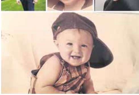
Happy 18th Birthday 2nd November 2017 To an amazing Son. We are so proud of you. Love always, Mam and Dad xxxx