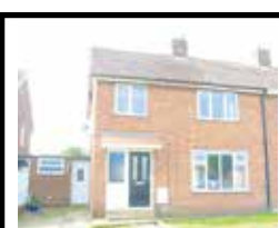
ATKINSON GARDENS Aycliffe Village

Recently refurbished three bedroom house, two doubles, attractive views over the Green the the front, UPVC DG, GFCH, open plan kitchen/diner, pleasant enclosed garden. Realistically priced to sell.